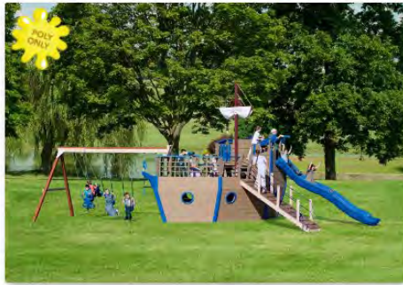
EXHIBIT A – Playground Equipment Purchase - Hersherberger Lawn Structures Ltd.