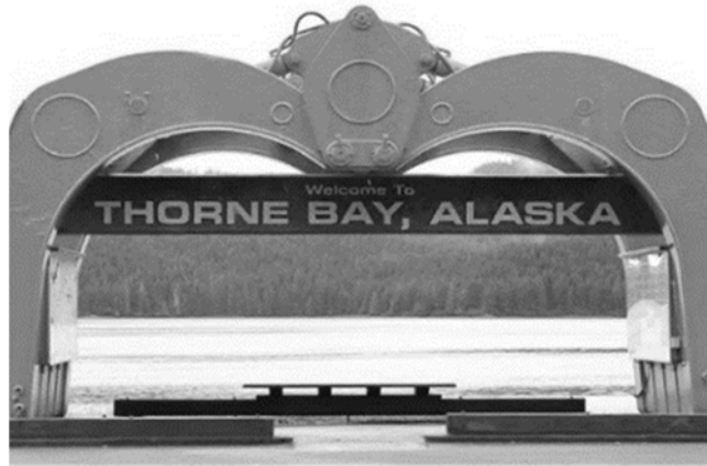
Thorne Bay Grapple, largest in the World!

The Public is encouraged to attend all meetings of the city council