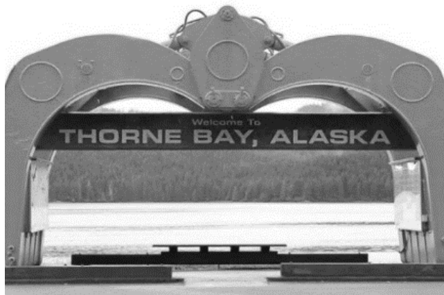
Thorne Bay Grapple, largest in the World!

The Public is encouraged to attend all meetings of the city council