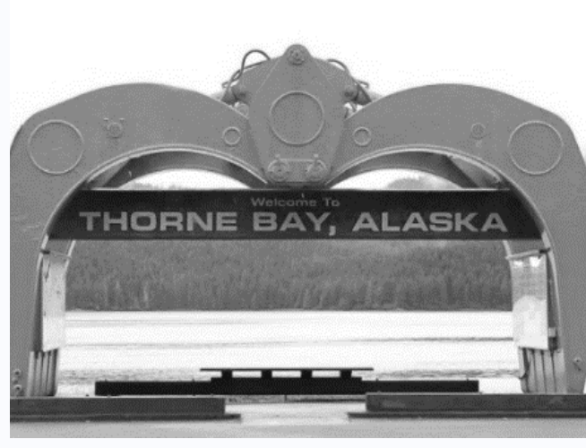
Thorne Bay Grapple, largest in the World!

The Public is encouraged to attend all meetings of the city council