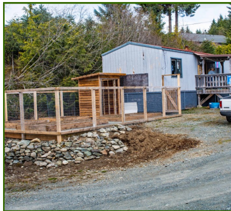
Thorne Bay Children's Garden with a new garden shed and the "deer proof fence". This photo also shows the

The garden was built by donated labor—the students in the Thorne Bay school helped put up the fence posts, and community members built the beds and filled them with soil.